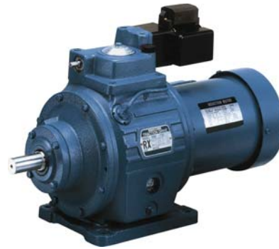
Ringcone Motor Assembly