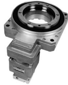
ABLE with Rotary Stage