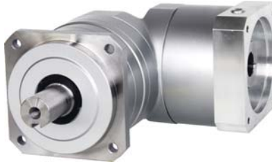
ABLE Right Angle Series