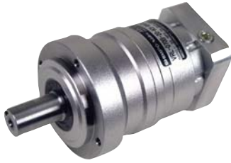
ABLE Inline Series