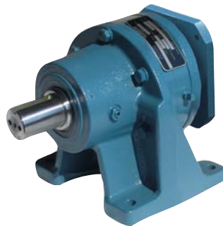
Circulute with Servo Input