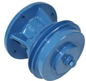
Circulute Pulley Style